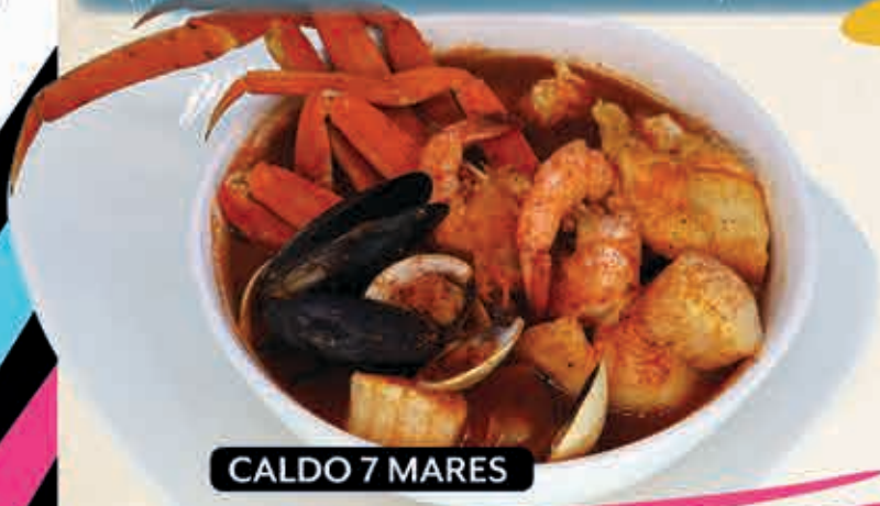
CALDO 7 MARES