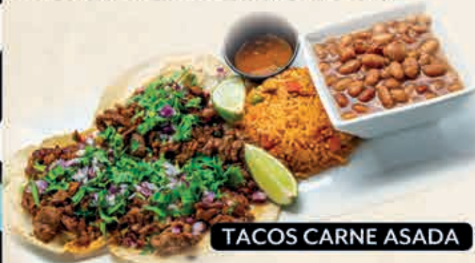
TACOS CARNE ASADA

Iceberg Lettuce, Avocado, Mozzarella Cheese, Onion & Tomato. Topped with Fried Chicken Tenderloin & Ranch Dressing on the Side.