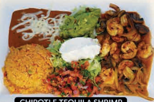
CHIPOTLE TEQUILA SHRIMP

Casa Amigos infused Shrimp with Onions, Mushrooms & Smoky Chipotle Lime Cream Sauce. Served with Lettuce, Guacamole, Sour Cream, Pico de Gallo, Rice & Refried Beans.