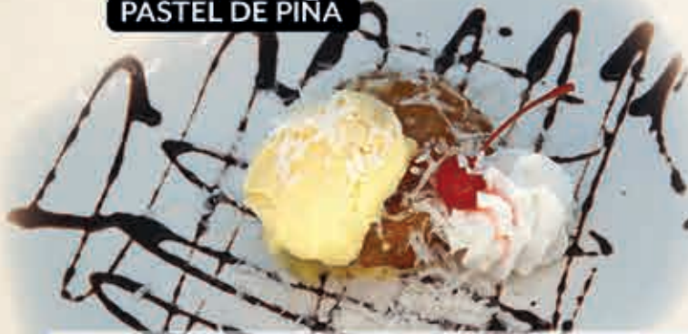
PASTEL DE PIÑA

Mexican Pastry Sticks Dusted with Cinnamon Sugar. Served with Caramel & Chocolate.