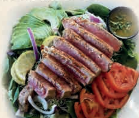
AHI TUNA SALAD

Fresh Salad Greens, Pico de Gallo, Onion, Bell Peppers, Mango, Pineapple, Jicama & Tortilla Strips. Topped with Fresh Avocado & Queso Fresco & Chile. Dressing on the side.