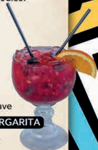
BERRY BERRY MARGARITA