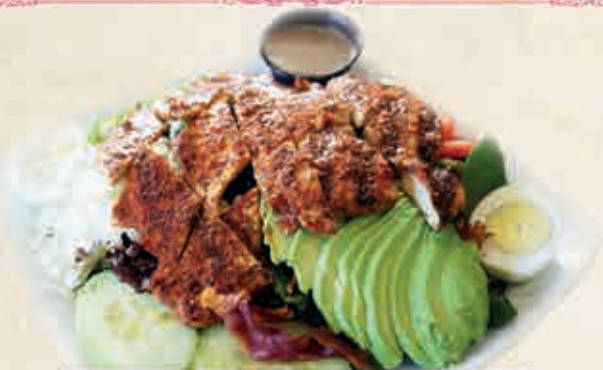
BLACKENED CHICKEN SALAD

A Crispy Flour Tortilla Shell Filled with Ground Beef or Shredded Chicken, Topped with Lettuce, Sour Cream, Shredded Cheese, Guacamole & Pico de Gallo. (Steak $17.99, Grilled Chicken $15.99)