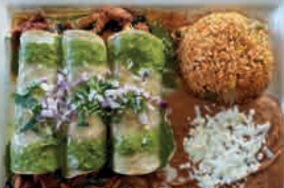
CHICKEN AND SPINACH ENCHILADAS

Four Enchiladas, One Ground Beef, One Chicken, One Cheese & One refried Beans. Topped with Red Enchilada Sauce, Shredded Chesse Lettuce, Pico de Gallo, Sour Cream & Guacamole.