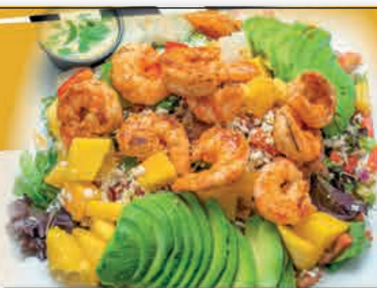
GRILLED CHILE SALAD WITH SHRIMP