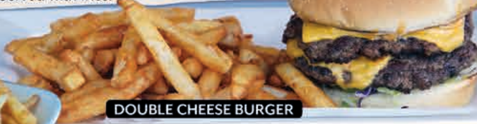
DOUBLE CHEESE BURGER

Mayonnaise, Lettuce, Tomato Fried Chicken Breast, Bacon & American Cheese. Served with fries.