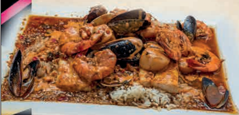
PAELLA CASA AMIGOS

Grilled Mahi Mahi Fish Fillet, Shrimp, Clams, Mussels & Scallops Sautéed in Garlic Butter Sauce & a Dash of Pico de Gallo, Red Wine, Chipotle Sauce. Served on a Bed of White Rice.